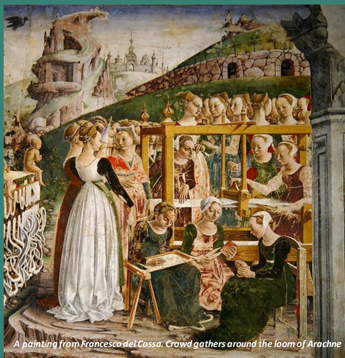
A painting from Francesco del Cossa. Crowd gathers around the loom of Arachne

In a moment of arrogance, she dared to invite Athena herself to a weaving competition