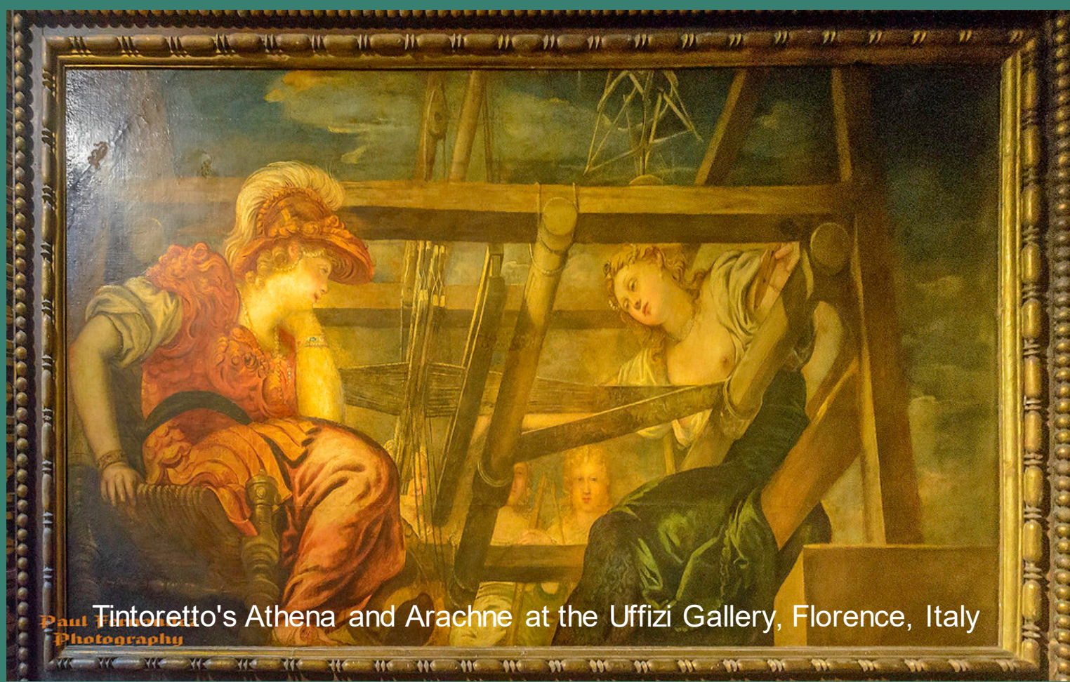
Tintoretto's Athena and Arachne at the Uffizi Gallery, Florence, Italy

The story of Arachne and Athena is one myth regarding the arrogance and the punishing of it, in Greek mythology.